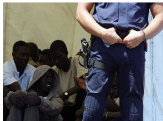
Immigrants in Detention

"No police measures alone will be effective. ... Rich countries have to take a deep look at how they deal with Africa: it is not just a provider of raw materials," he said after attending a conference on migration in Dakar this week.