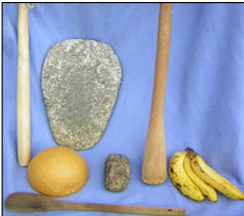
Some instruments used for breast ironing

But the Association of Aunties hopes their campaign will start to change attitudes and spare other girls future physical and emotional pain.